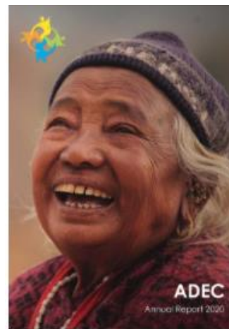
Annual Report 2019 - 2020 - Easy English