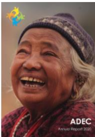
Annual Report 2019 - 2020

ADEC was proud to launch our 2020 annual report in November. To view the report, please click on the below link or visit our website.